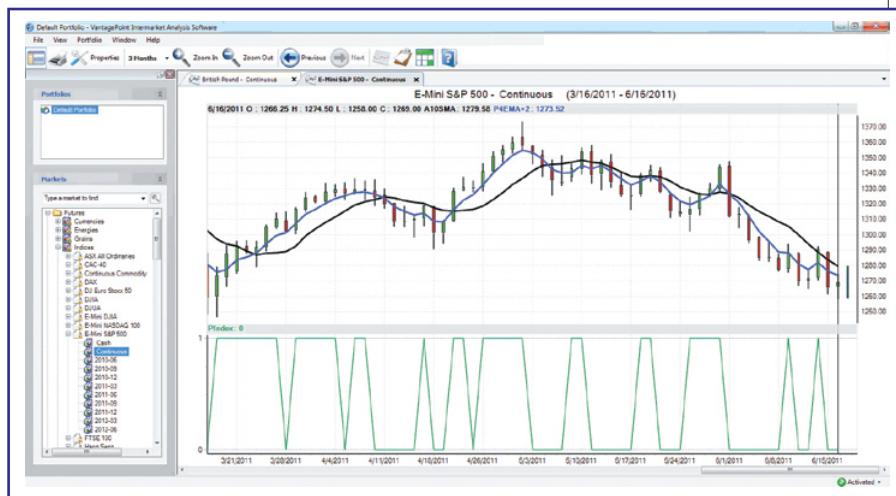
FIGURE 1: OPENING SCREEN

With each new release, VantagePoint retrains and updates its software's neural